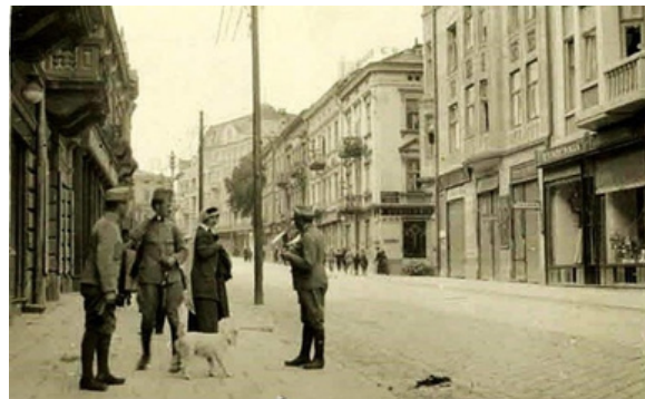
Przemyśl Before The War