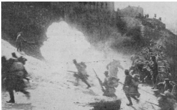
Siege of Przemyśl

Today, visitors can still see parts of the fortress system scattered around Przemyśl. These sites offer a chance to reflect on the past while experiencing the natural surroundings that have reclaimed much of the area. This is a story of strategy, survival, and transformation. Przemyśl’s fortress is not just a military structure, but a window into a moment in history that shaped both the city and the wider region.