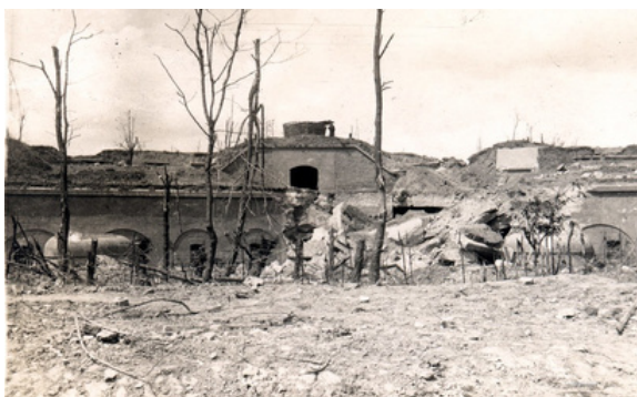
Ruins of Przemyśl