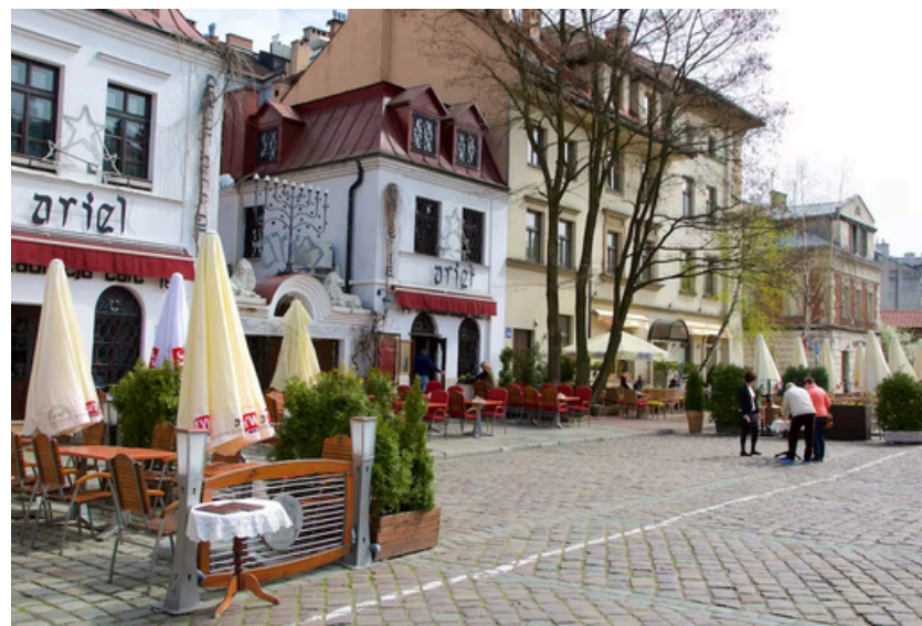
Kazimierz in 2026

That life was shattered in 1941. But the buildings remain. And when you walk Kazimierz today during the sacred season, past the worn mezuzah marks on doorframes, past the church bells, past the restored synagogue interiors, you are walking through a neighbourhood that still carries the memory of what it meant for two worlds to share the same streets, the same market square, the same spring sky.