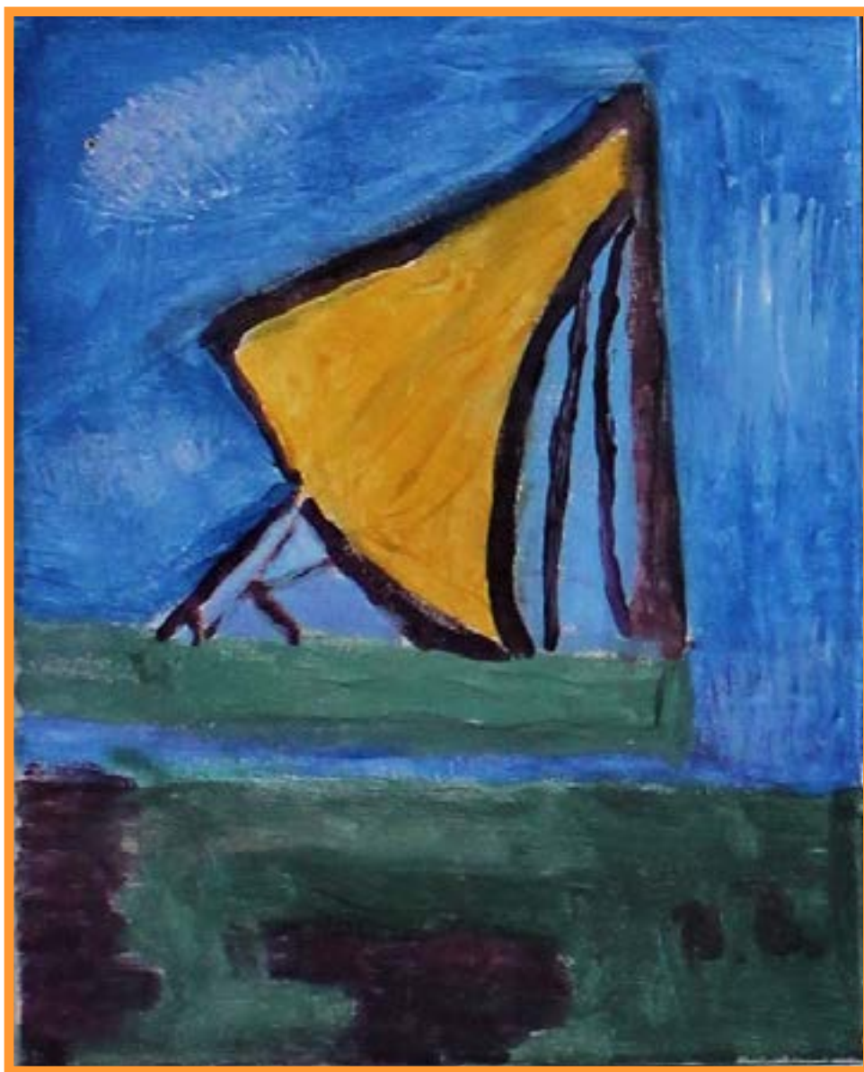
Artwork provided by Bihl Haus GO! Arts program participants at Grace Place Alzheimer's Activity Centers