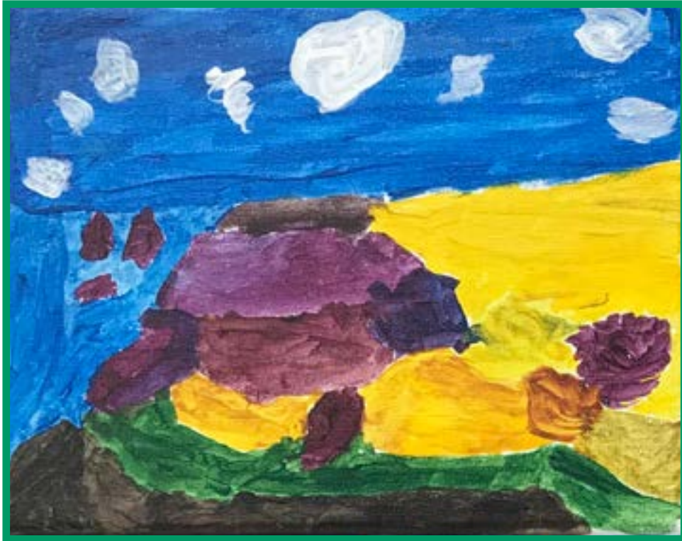
Artwork provided by Bihl Haus GO! Arts program participants at Grace Place Alzheimer's Activity Centers