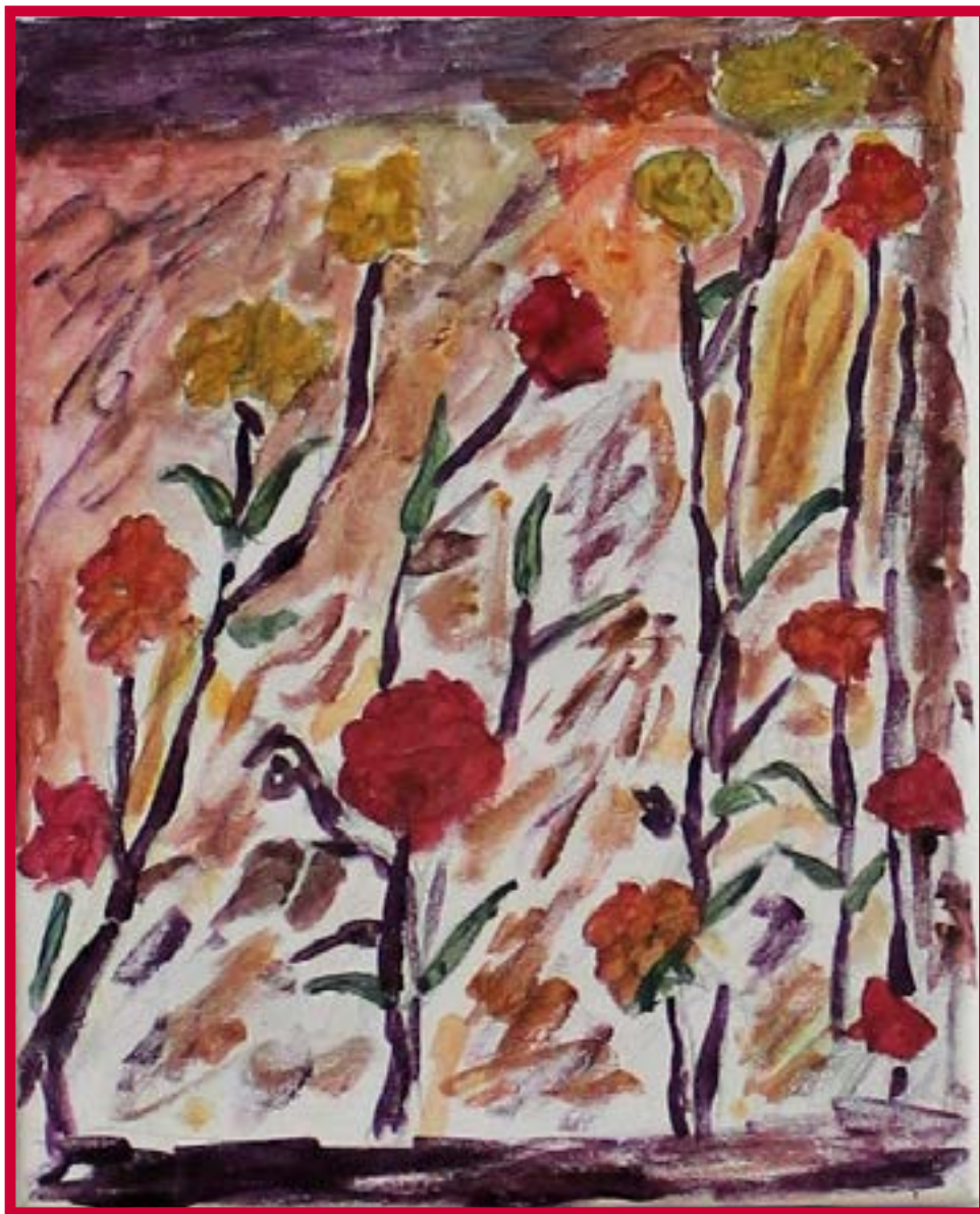
Artwork provided by Bihl Haus GO! Arts program participants at Grace Place Alzheimer's Activity Centers