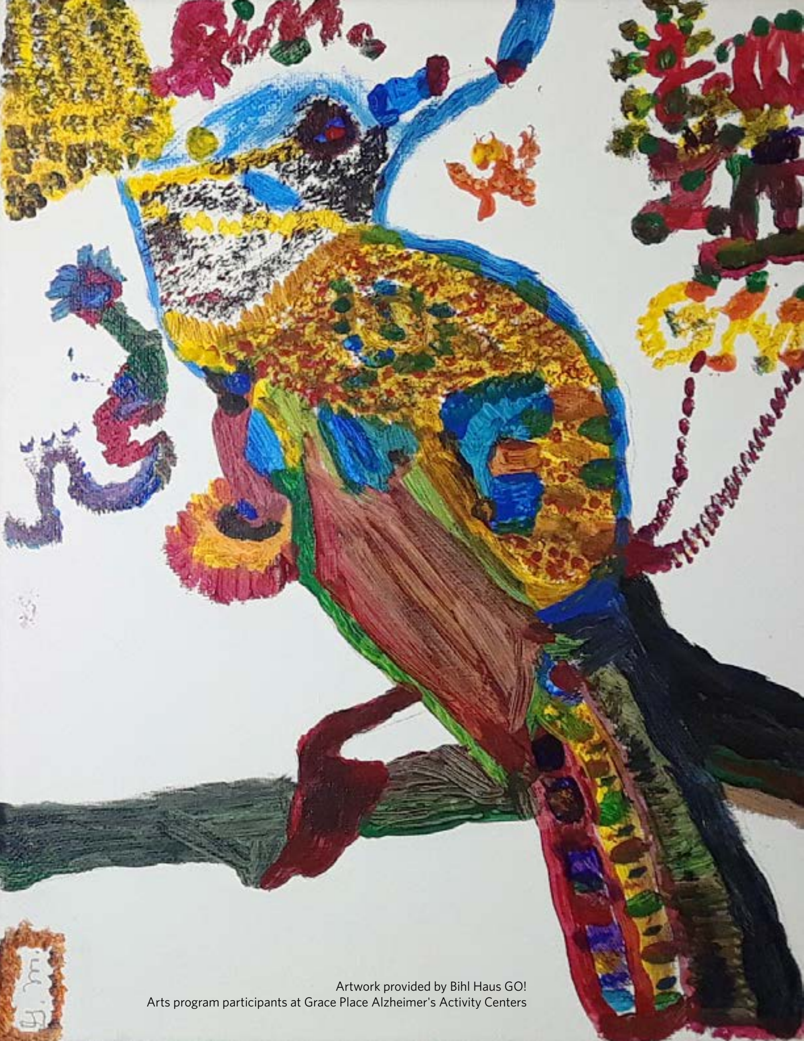
Artwork provided by Bihl Haus GO! Arts program participants at Grace Place Alzheimer's Activity Centers