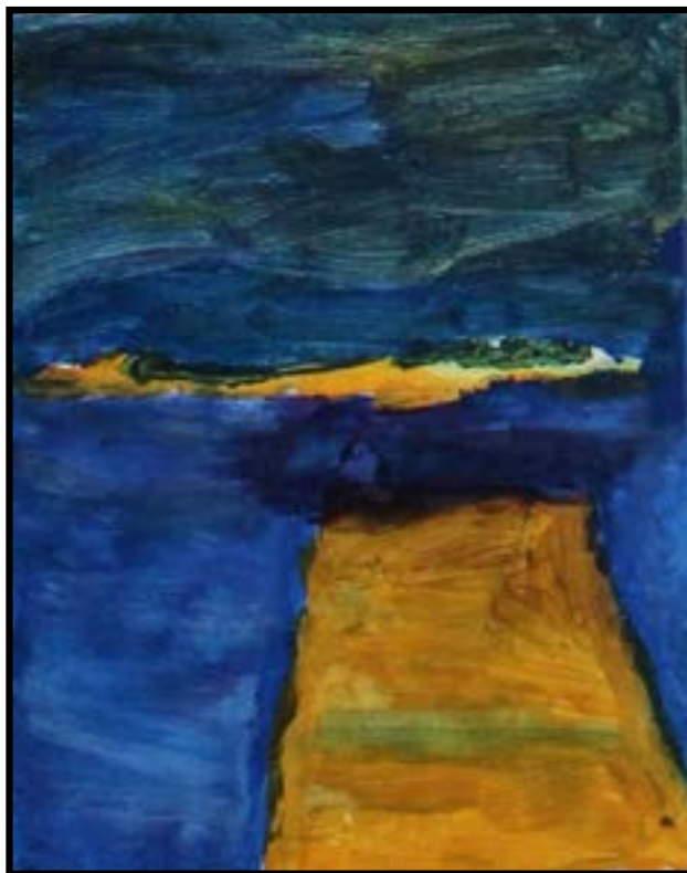
Artwork provided by Bihl Haus GO! Arts program participants at Grace Place Alzheimer's Activity Centers