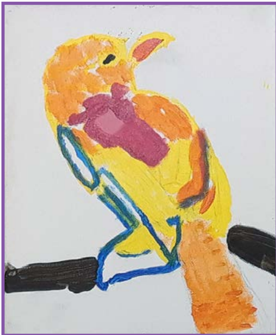
Artwork provided by Bihl Haus GO! Arts program participants at Grace Place Alzheimer's Activity Centers