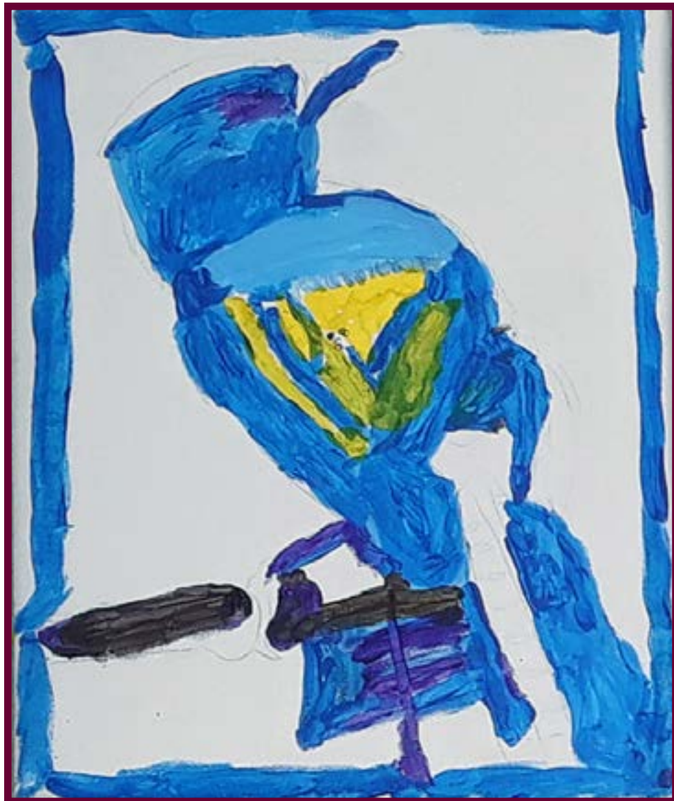
Artwork provided by Bihl Haus GO! Arts program participants at Grace Place Alzheimer's Activity Centers