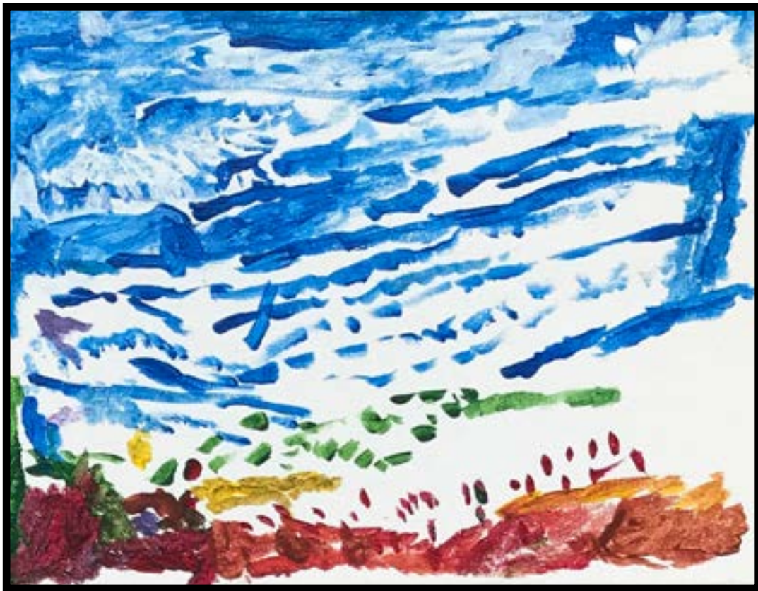
Artwork provided by Bihl Haus GO! Arts program participants at Grace Place Alzheimer's Activity Centers