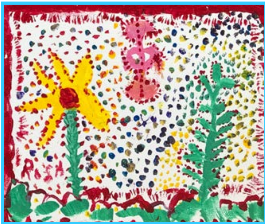
Artwork provided by Bihl Haus GO! Arts program participants at Grace Place Alzheimer's Activity Centers