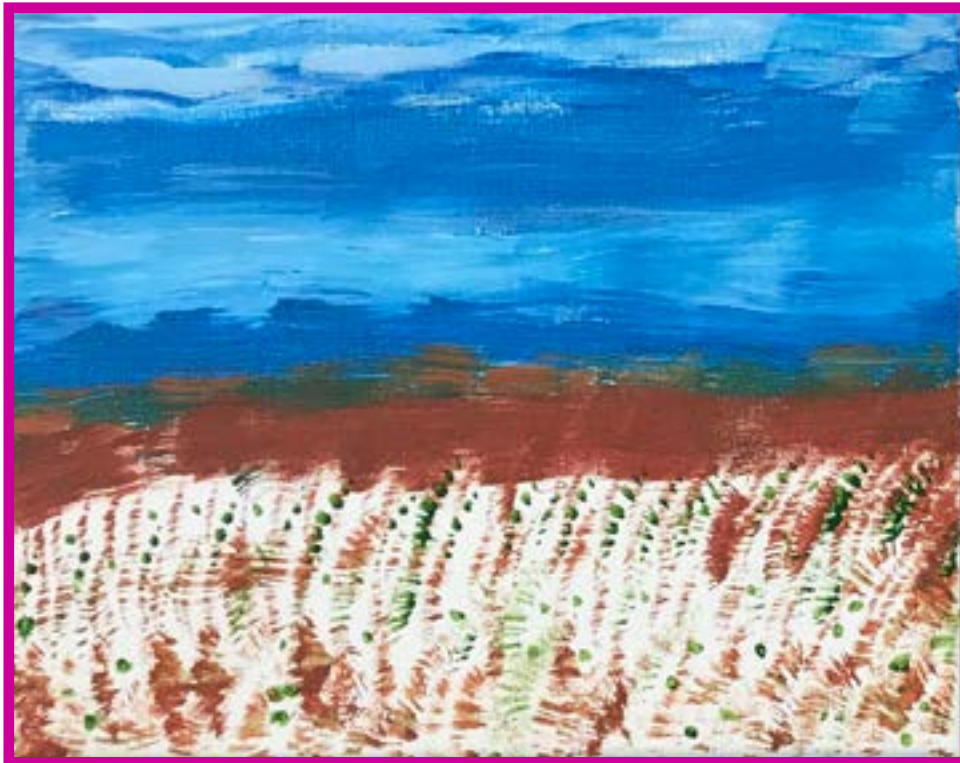
Artwork provided by Bihl Haus GO! Arts program participants at Grace Place Alzheimer's Activity Centers