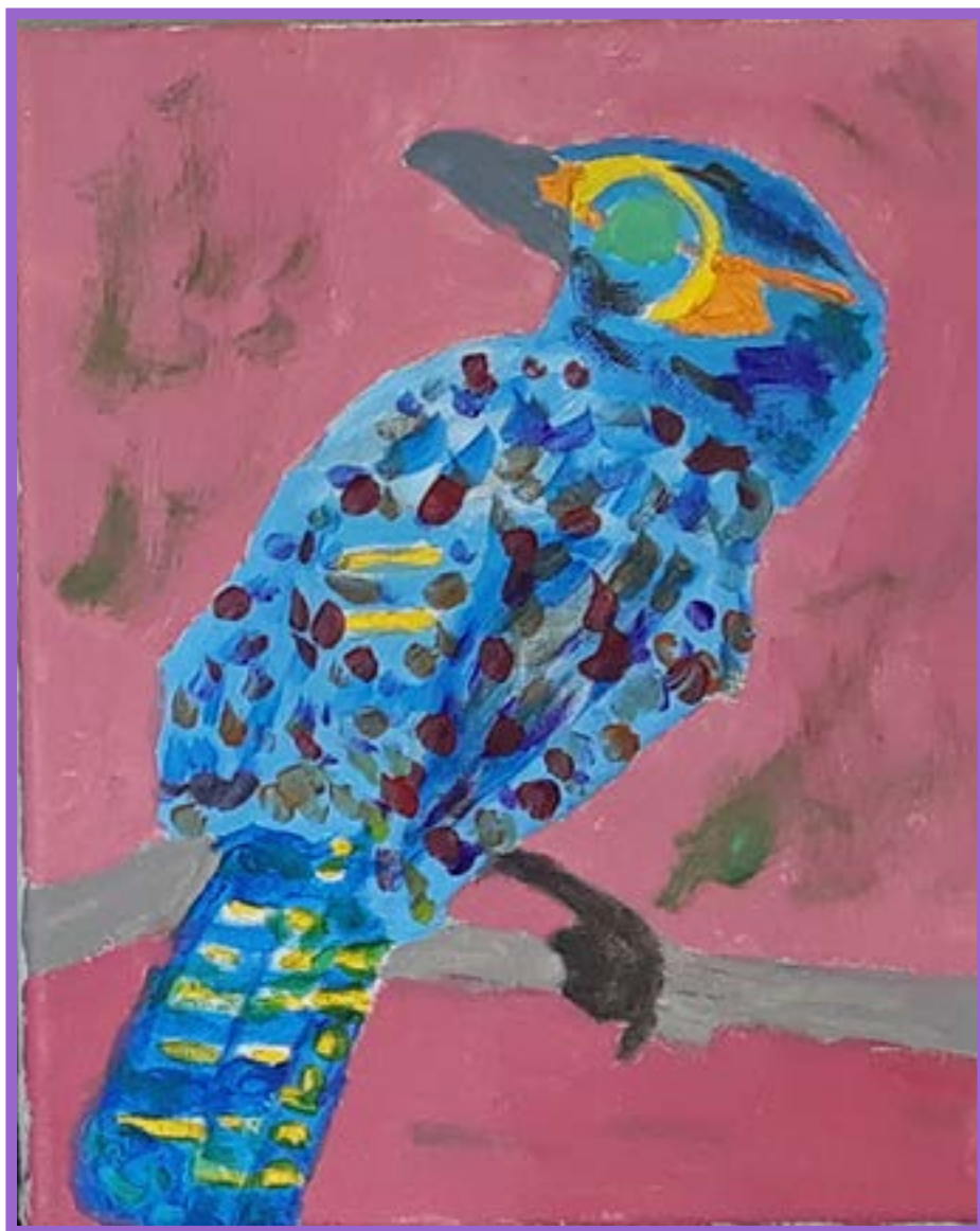
Artwork provided by Bihl Haus GO! Arts program participants at Grace Place Alzheimer's Activity Centers