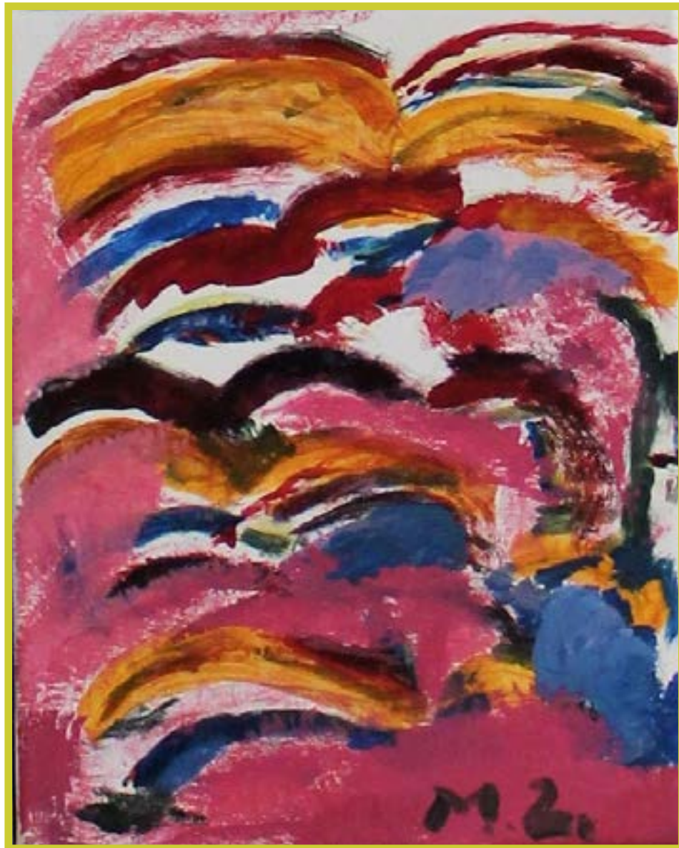
Artwork provided by Bihl Haus GO! Arts program participants at Grace Place Alzheimer's Activity Centers