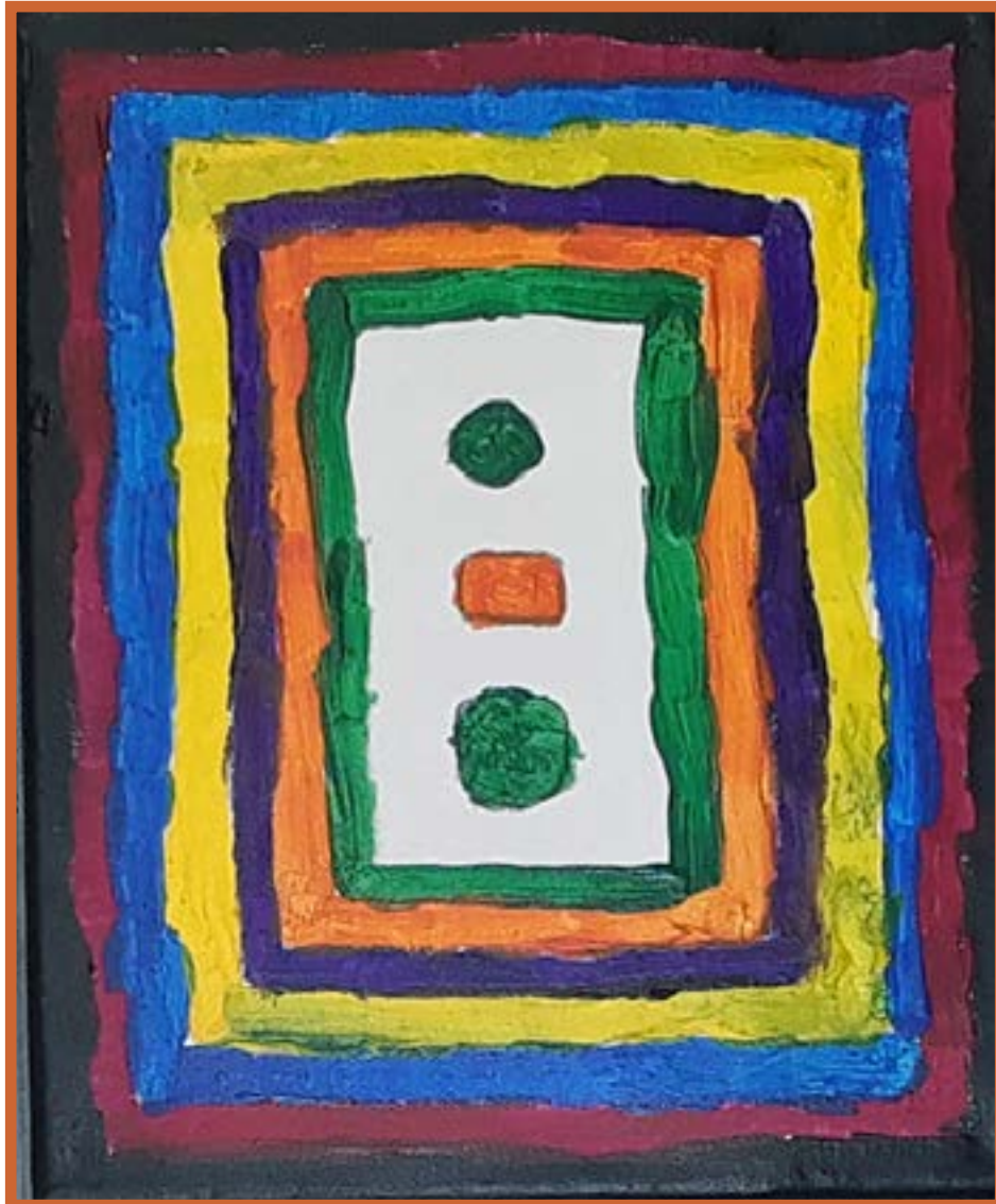
Artwork provided by Bihl Haus GO! Arts program participants at Grace Place Alzheimer's Activity Centers