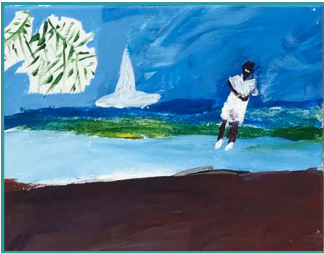
Artwork provided by Bihl Haus GO! Arts program participants at Grace Place Alzheimer's Activity Centers