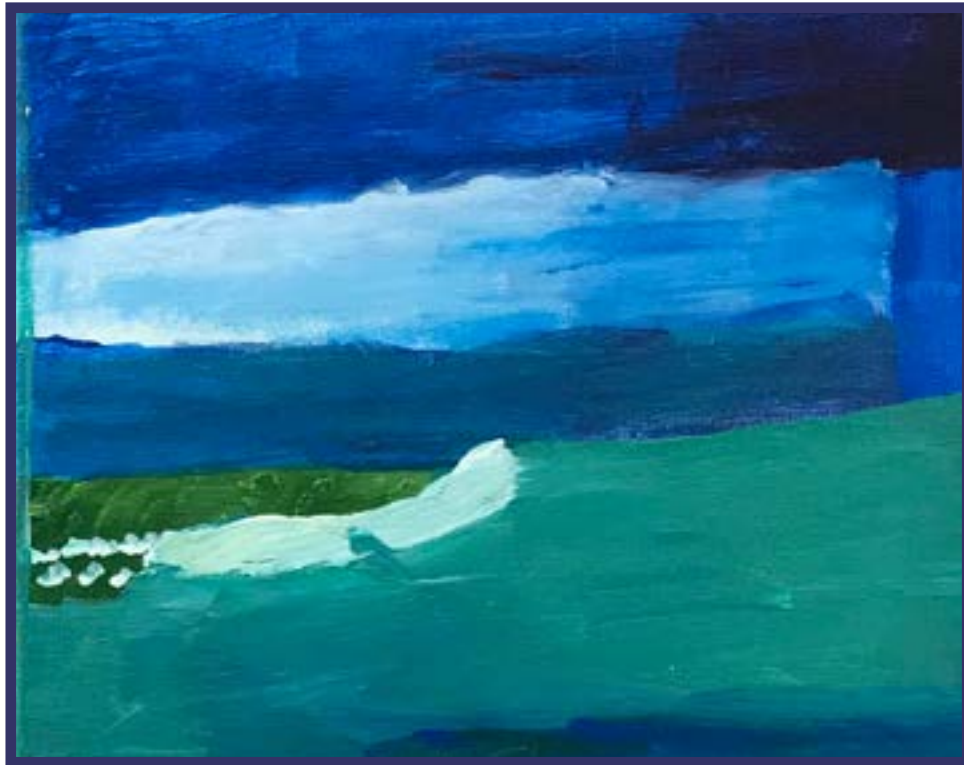
Artwork provided by Bihl Haus GO! Arts program participants at Grace Place Alzheimer's Activity Centers